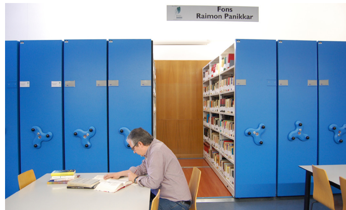
The Raimon Panikkar Collection at the UdG Library

a diverse range of sources, are not available in any other university libraries, and the collections of journals in the fields of religions and philosophy are outstanding: Daedalus , Eastern Buddhist , Ecumenical Review , Esprit , Journal of Consciousness , Journal of Dharma , Journal of the American Academy of Religion , Philosophy East and West , Philosophy Today , Revue Philosophique de Louvain , Theological Studies , Harvard Theological Review , Thomist , Zeitschrift für Religions- und Geistesgeschichte , etc.