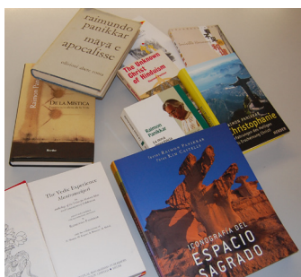
Raimon Panikkar's works at the UdG Library

Many of the books in Panikkar's collection are signed and dedicated by the authors (E. M. Cioran, Martin Heidegger, Hans Küng, Octavio Paz, Peter Sloterdijk, Ramon Xirau et al.), and include references to the works of Panikkar. We are therefore not dealing with a collector's library, but with a working library which has been read, reread and commented by a prolific thinker.