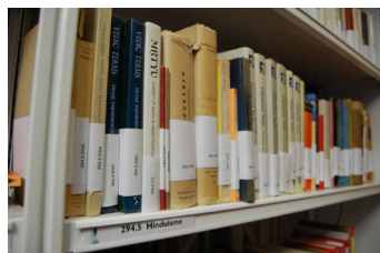
Hindu section in Raimon Panikkar Collection

Logically, it is Christianity, and especially Catholicism, which lies at the heart of this section, but the material on the history of religion and comparative religion is, through Panikkar's